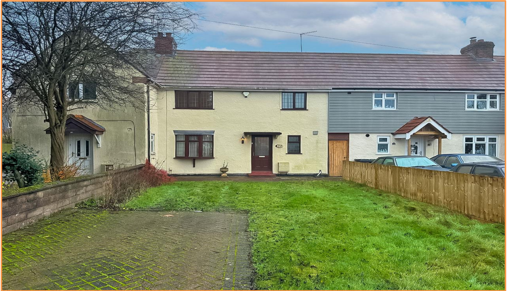
Vaughan Road, Portobello Willenhall, WV13 3TJ